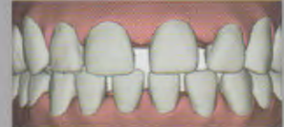
SPACING Spaces between the teeth