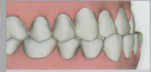
UNDERBITE Protruding lower teeth