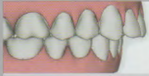
OVERBITE Protruding upper teeth