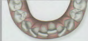
CROWDING Not enough room for the teeth

Many people believe that Invisalign is only effective at treating minor orthodontic issues. But the fact is that our 96% patient satisfaction rate 1 is a result of successfully treating a broad range of cases, from overly crowded teeth and underbites to jaw problems and tooth misalignment.