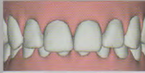
DEEP BITE Upper front teeth hide lower teeth