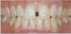
SPACING TREATMENT Nine months, 19 aligners