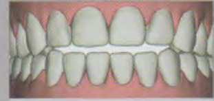
OPEN BITE Back teeth are together but space is present between the front teeth