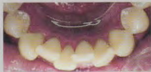
CROWDING TREATMENT Seven months, 14 aligners